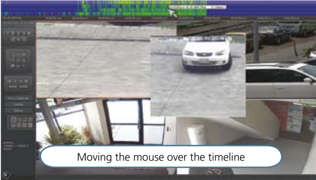
Moving the mouse over the timeline