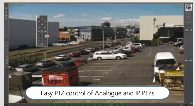
Easy PTZ control of Analogue and IP PTZs