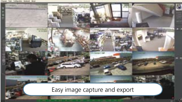
Easy image capture and export